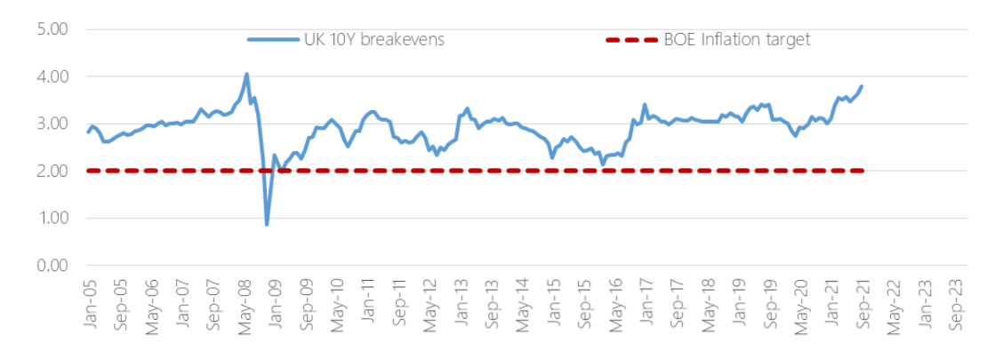
Fig.1. UK inflation