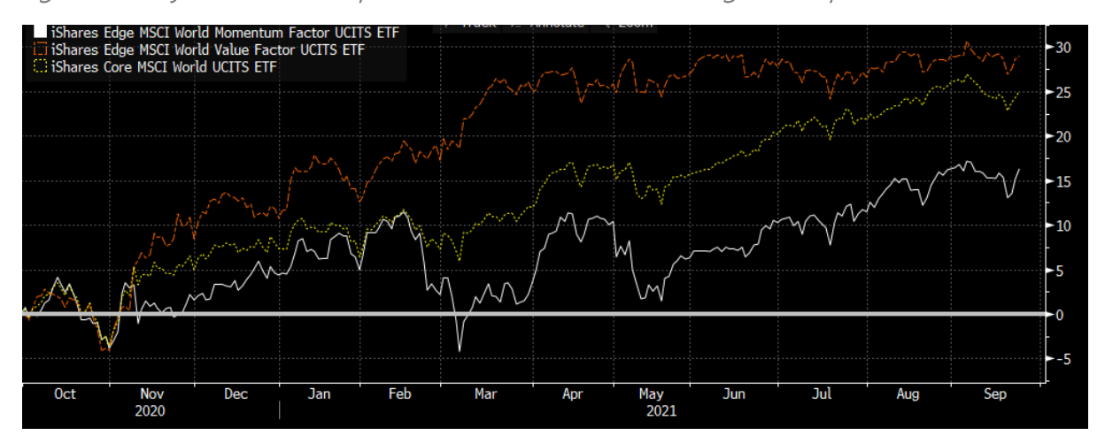
Fig.4. Value style factor has outperformed since inflation fears begain in Sep-20

However since inflation fears commenced in September 2020, world equity Value factor has materially outperformed the traditional market-cap weighted world equity exposure, and Momentum factor.