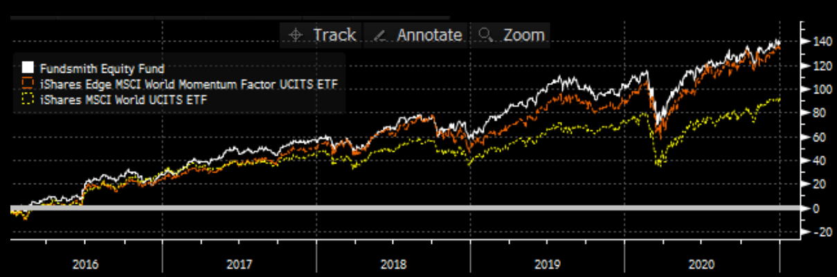
Fig.1. Close call between Fundsmith & Momentum factor for trouncing MSCI World

We were astonished to see that the performance was almost identical to the iShares EDGE MSCI World Momentum Factor UCITS ETF (the "Momentum ETF") which tracks the MSCI World Momentum Factor index (the "Momentum Index").